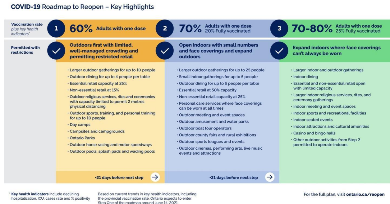
Figure 1: Province of Ontario's "Three-Step Roadmap to Safely Reopen the Province". May 20, 2021.

As provinces began to loosen COVID mandates, such as mask wearing indoors, contact tracing, mandatory double vaccination to enter various public spaces, many post-secondary institutions followed. In figure 1 below, is Ontario's three-step plan to re-open the province with the expectation that vaccinations numbers increase. This expectation of re-opening the province had led to post-secondary institutions having the same vision of re-opening their campuses for in-person learning.